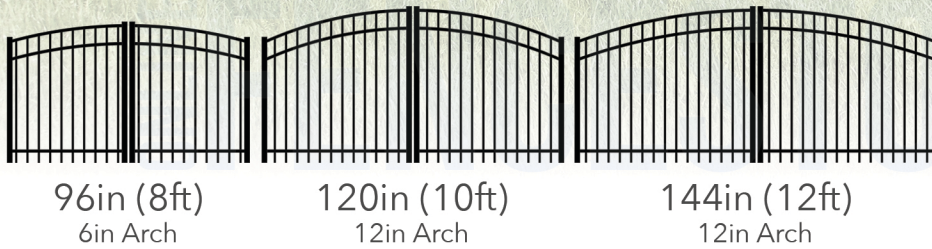
96in (8ft) 6in Arch