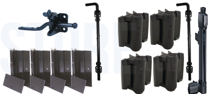
Standard Hardware (4) Self-Closing Aluminum Hinges, (1) 24in Drop Rod & (1) Gravity Latch