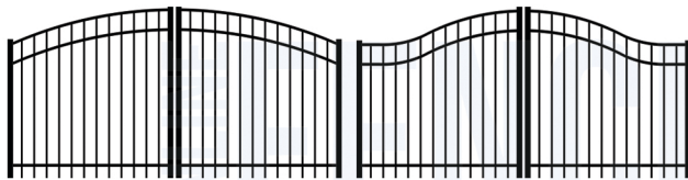
Rainbow Arch Top