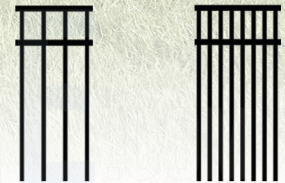
Standard 3-13/16in Gap