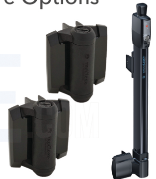
Pool Code Hardware (2) Self-Closing Tru-Close Hinges & (1) MagnaLatch