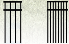
Standard 3-13/16in Gap