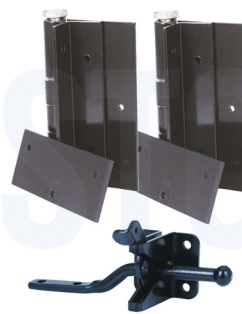
Standard Hardware (2) Self-Closing Aluminum Hinges & (1) Gravity Latch