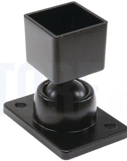
Swivel Wall Mount Bracket

Used to attach to a column or side of a house.