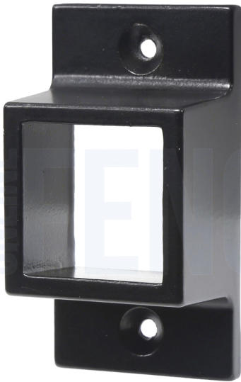
Fixed Wall Mount Bracket