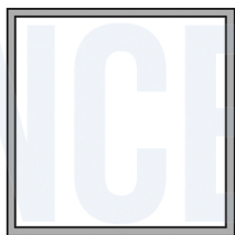
Post Cross-Section 2-1/2in x 2-1/2in x 0.075in Wall Thickness

2-1/2in x 2-1/2in Blank Posts are primarily used for a sturdier installation. Use wall mounts to connect fence panels to posts. Post routing is also an option to match your fence panel.